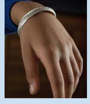
Compulsory religious jewellery