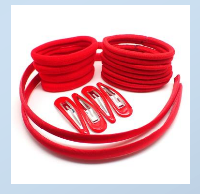
Red, simple hair accessories