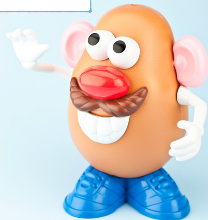
Mr Potato Head