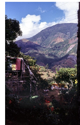
Blue Mountain Peak