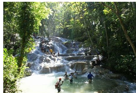
The Dunn's Rivers Falls